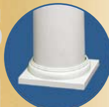
Urethane Low Profile Tuscan Base